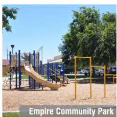
Empire Community Park

The Department maintains five regional parks, 12 neighborhood parks, ten community parks, two Off-Highway Vehicle parks, four cemeteries, two bridges, La Grange historical areas, five fishing access points along rivers and lakes, one swimming pool, one organized youth camp, and numerous acres of open space and river bottom. The Administration division implements the functions of budget, human resources, marketing, grant coordination, project management, partner development, and aligning maintenance, operational, and customer needs. The Community Parks/County Centers division manages the maintenance and operations of the parks, flood control landscape, and streetscapes within County Service Areas 1, 10, 16, 18, 19, 21, 22, 24, 25, 26, and Del Rio Heights Landscape Assessment District; the Helen White Trail; Fox Grove, Riverdale and Las Palmas Fishing Accesses; Pauper's, Cemetery; the Regional Water Safety Training Center located in Empire; Atlas, Bonita, Burbank-Paradise, Empire Community, Empire Tot Lot, Fairview, Leroy F. Fitzsimmons, Mono, Oregon Drive, Parklawn, Riverdale, Salida, and the United Community Parks. The Regional Parks division is responsible for the maintenance and operations of Woodward Reservoir, Modesto Reservoir, Frank Raines Off-Highway Vehicle Park, LaGrange Off-Highway Vehicle Park, Laird Park and a small lot within the Knights Ferry area.