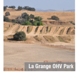
La Grange OHV Park

All of Parks' revenue and related accounts are tracked, maintained, invoiced, and processed through the accounting office.