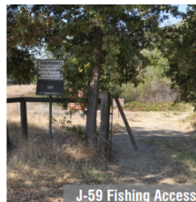
J-59 Fishing Access