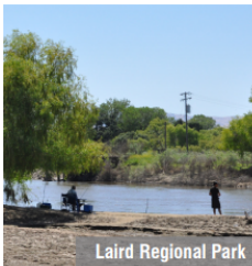
Laird Regional Park