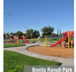
Bonita Ranch Park