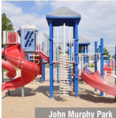
John Murphy Park