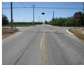
Hart Road - Before