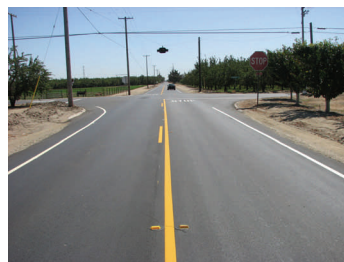
Hart Road - After