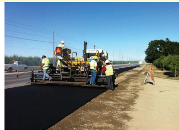
First lift of asphalt concrete paving of the roadway widening.