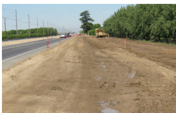
Rough graded pavement widening to the north of the existing roadway.