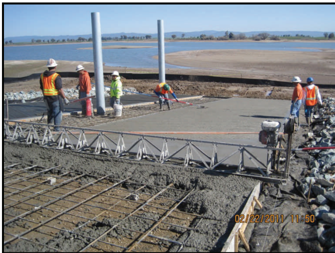
Concrete Boat Ramp Pour

The improved Heron Point Facility will definitely be attracting many boaters, fisherman, swimmers, and families to Woodward Reservoir. The anticipated date of completion for this project is summer 2011.