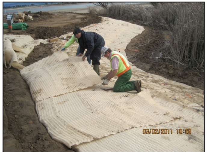
Installation of Environmentally Friendly Bank Protection