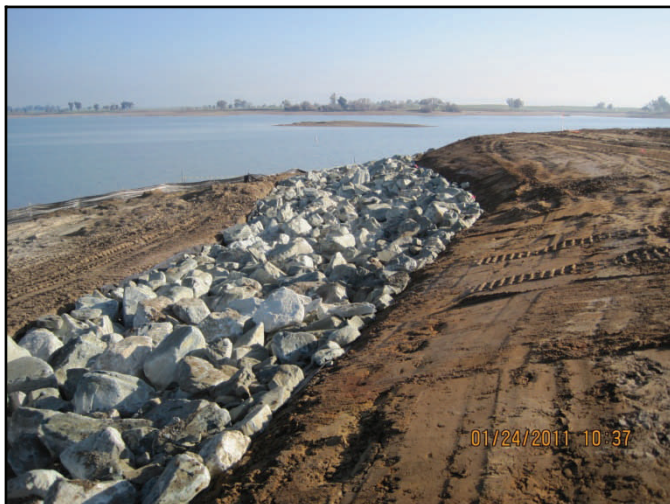
Rip-Rap Slope Protection