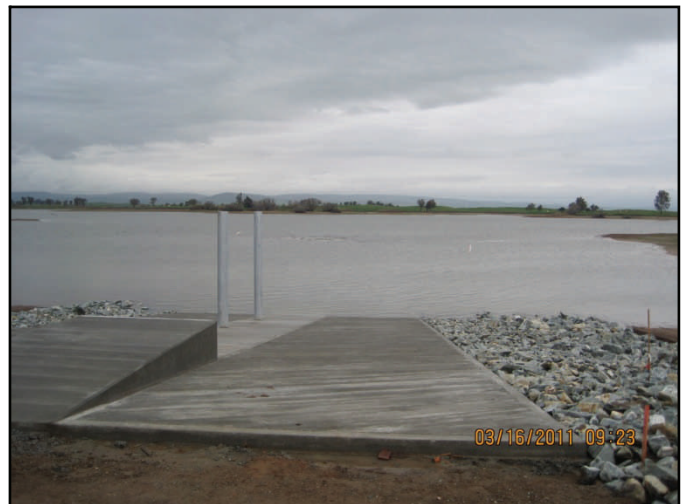
Concrete Boat Ramp