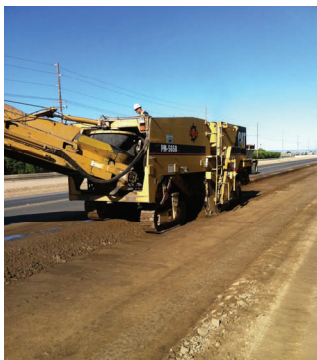
Pavement grinder removing the westbound shoulder.