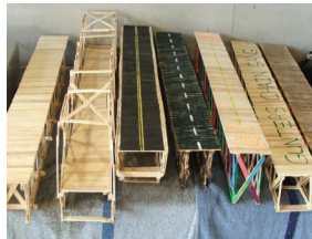
Bridges before the "test"

Our loading equipment was rather crude this year, with hopes of improvement for next year. A bucket loaded with aggregate with a weight measuring pulley was used to measure the breaking point of each bridge. Team members loaded the buckets themselves. The anticipation of each break was almost unbearable as some broke rather quickly while others stayed the course. The most surprising was the bridge built by the