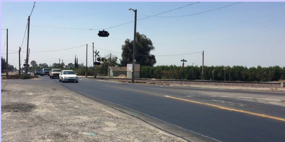
Geer Road looking south towards the existing Santa Fe Avenue intersection

Signalization will involve the installation of foundations, poles, and mast arms to support the proposed signal assemblies, street name signs, and luminaires as well as control boxes and other related equipment. Multi-phase control would be provided to accommodate anticipated turning movements on all four approaches. The improved roadway sections would be restriped and signed in accordance with county and state standards. The project also involves some railroad crossing improvements, such as a change in cross arms. Equipment and materials staging for the project will occur within existing County road right-of-way. No new right-of-way acquisition is required.